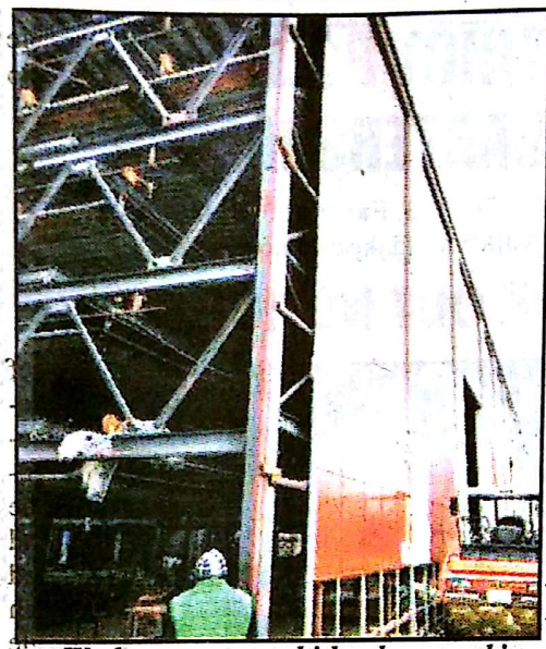
Work space on multi-level car parking at Srinagar.

Excelsior Correspondent SRINAGAR, Mar 23: Work on first semi automatic multilevel car